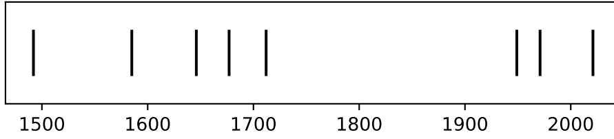
Figure 1: Timeline of recent earthquakes on La Palma

Based on data up to and including 1971, eruptions on La Palma happen every 79.8 years on average.